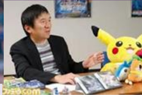
Satoshi Tajiri Creator of Pokemon