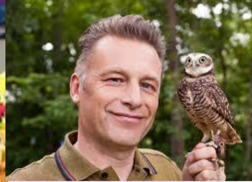
Chris Peckham – Naturalist, Nature Photographer, TV presenter, Author