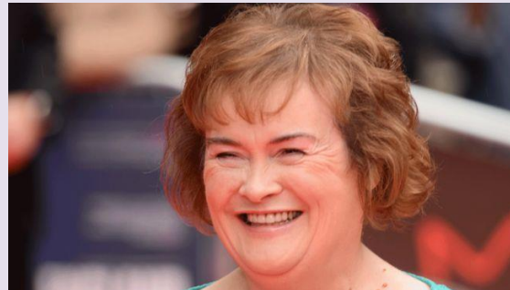
Susan Boyle - Singer