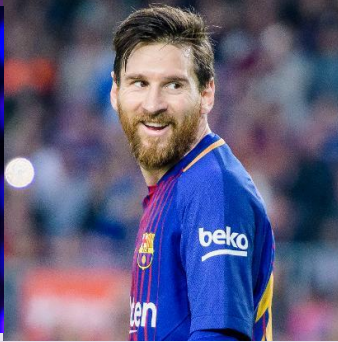
Messi - Footballer